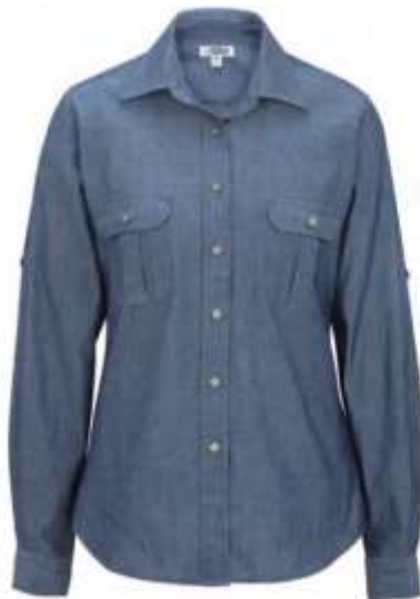
5298 Ladies' Shirt