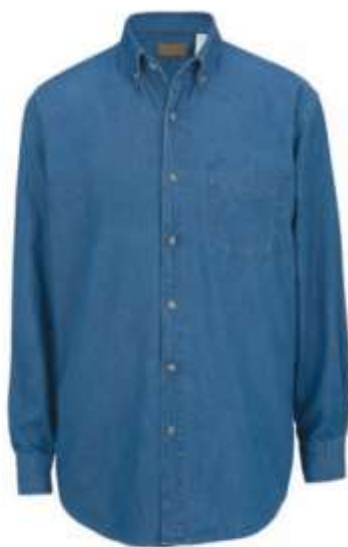
1093 Long-Sleeve Shirt