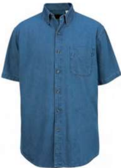
1013 Short-Sleeve Shirt

Prices apply to regular sizes XXS-XL and are subject to change. Please inquire for pricing on larger sizes.