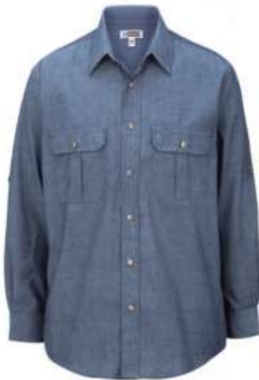
1298 Men's Shirt

Prices apply to regular sizes XXS-XL and are subject to change. Please inquire for pricing on larger sizes.